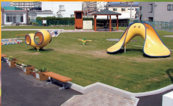
Front garden of playground

A variety of flowers are in bloom all the year round in the greenhouse - Bougainvillea, Hibiscus and Angel Trumpet.