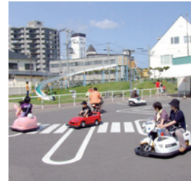
Battery-operated go karts