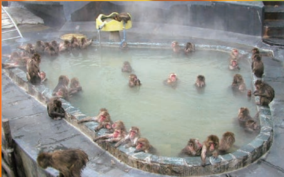
Japanese Monkeys warm up in the hot spring

The greenhouse is about 300 species, planted 3,000 of tropical plants, overlooking the plant from the middle of the observatory. Also, outside of the monkey mountain Japanese Monkeys to enter the hot spring only winter period is especially popular. (Japanese Monkeys entering the year tour possible. Hot Springs from December 1 to May Golden Week)