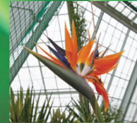
Bird of Paradise