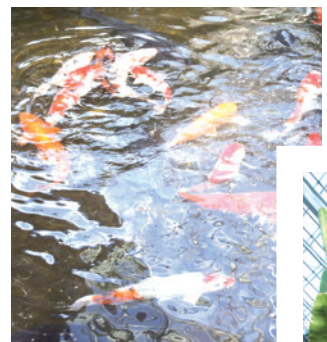
Carp swimming in the pond