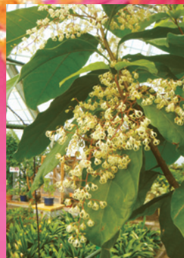
Ping-pong tree's flower