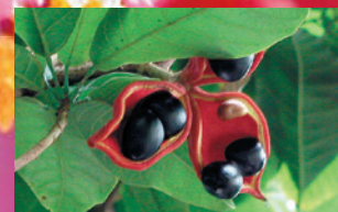
Ping-pong tree's fruit

The greenhouse is the habitat of trees with interesting names, too — Breadfruit Trees, Ping-pong Trees, Chewing Gum Trees, and others.