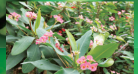
Crown of Thorns

Beside the greenhouse is a water square, which becomes a popular and lively place in summertime with many children.